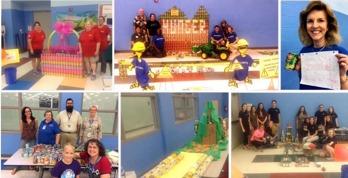
AAA South Sarasota Team, Dorothy's Basket; Manatee County Government Library Team, Yellow Brick Road and Emerald City; ReadingPals & United Way Team, Demolishing Hunger Wall; Eaton & Lakewood Ranch National Honor Society Students, Tin Man